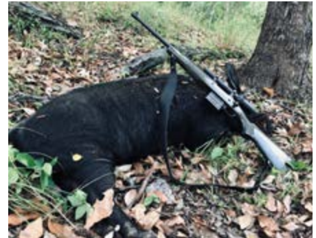
The proof is in the pig.

work, there was no doubting my rifle was bang on target. The Caldwell Rock Deluxe is available at your local gunshop and retails for around $269. ●