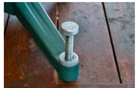
One of the independently adjustable levelling screws with locking ring.