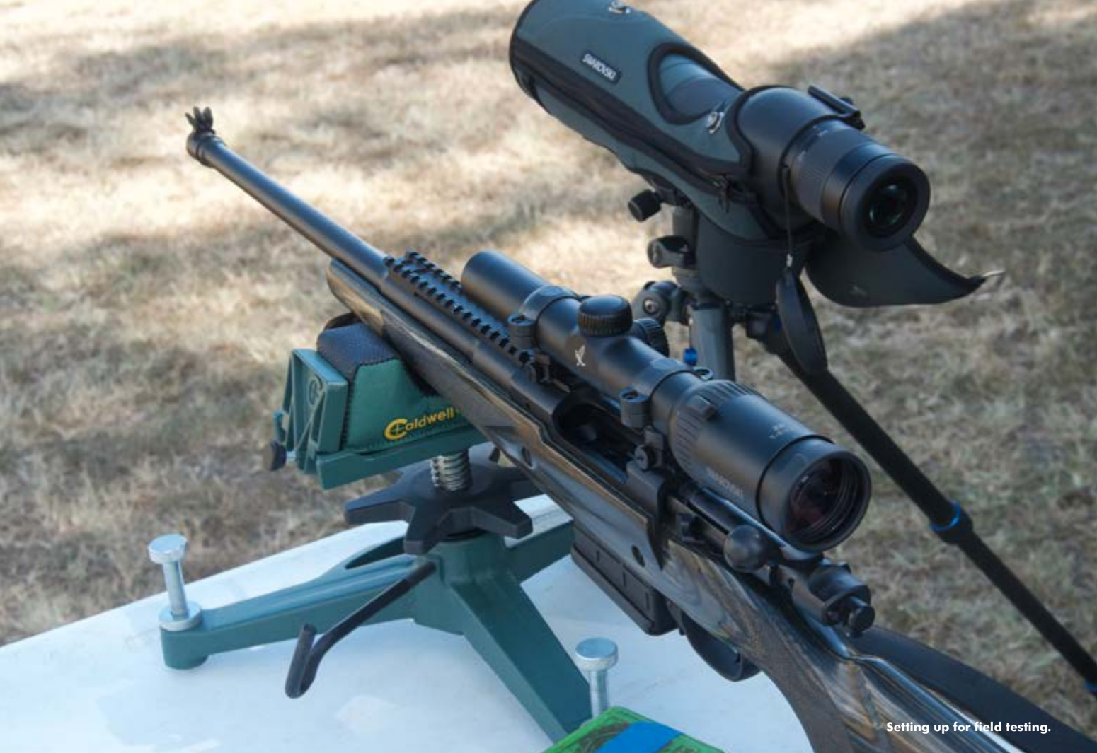
Setting up for field testing.