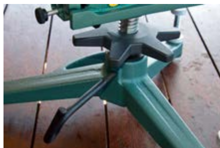
Six-point elevation wheel and locking mechanism.

Your rifle rests on a cradle supported by a filled, front varmint-style bag. The bag also has two Velcro straps to keep it in place, while the cradle has two adjustable ears which allow you to secure different