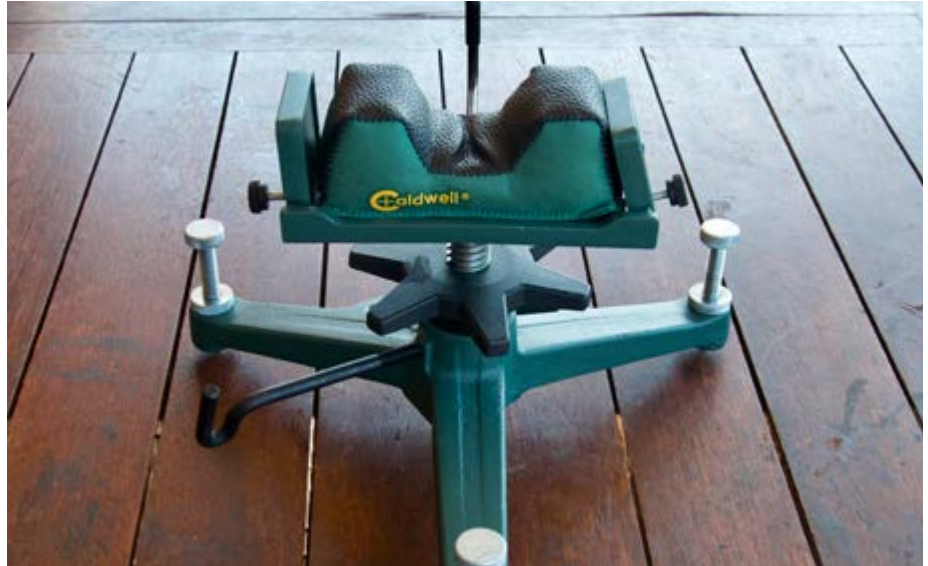
The Rock Deluxe assembled and ready to go.

After firing a series of shots at the target I wondered why I hadn't bought a rest previously. Checking the zero was a breeze and as a part of my shooting kit, The Rock Deluxe proved its worth in making the whole process so much easier. It was really